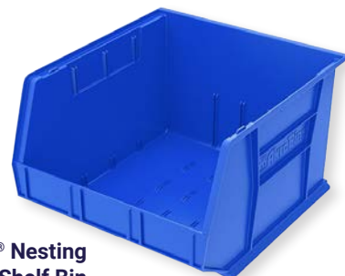
ShelfMax® Nesting Shelf Bin