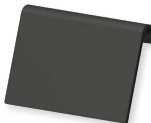
Extended Label Holder