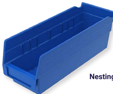
Nesting Shelf Bin