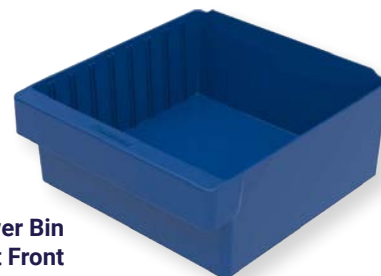
Drawer Bin with Flat Front